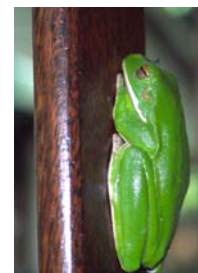
Green Tree Frog

13/10. We started this day with a visit to Cairns Crocodile Farm, mentioned as a good birding site. Sorrowfully the farm is nowadays closed to the public, we found. Along the road > 30 Chestnut-breasted Munia in the Edmonton sugarcane fields. To the rainforest, and mangrove opposite Flecker Botanical Garden and the Centenary Lakes, to look for Little Kingfisher . None Kingfisher but Pacific Black Duck , Great Egret , Little Black Cormorant , Magpie Goose and thousands of biting gnats as it used to be in mangrove swamps.