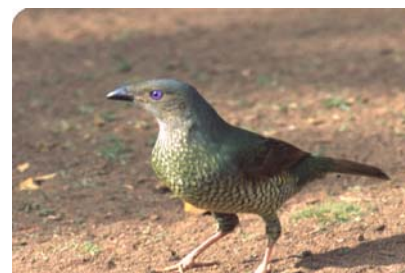
Satin Bowerbird female. O'Reillys