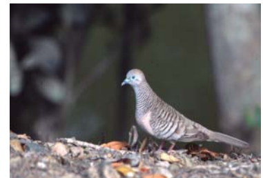
Peaceful Dove, Centenary Freshwater Lake, Cairns