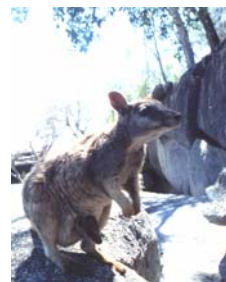
Rock Wallaby. Granite Gorge