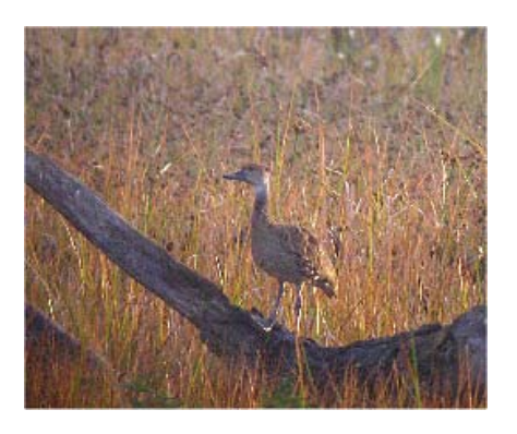
West Indian Whistling Duck