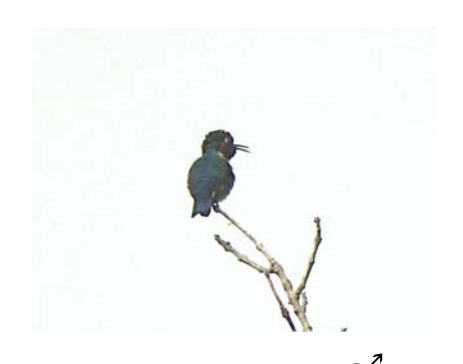
Bee Hummingbird O