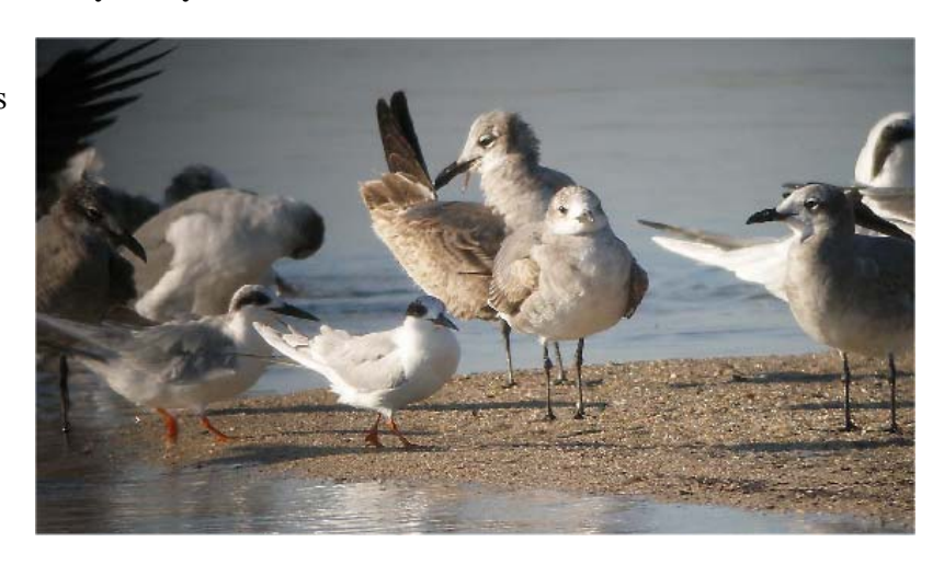
A Flock of Forsters Terns and Laughing Gulls

Up 07,00 Breakfast 07,30 late for 1<sup>st</sup> time, then birding along the beach and in the mangroves at Playa Playita until 13,00. Quite a good locality, lots of warblers, Terns, gulls and waders. Time to stop birding and go back to the winter in Sweden. It proved to be very cleaver staying outside the Havana area south of the city. This made the driving into the airport very straightforward and smooth. +30°C today.