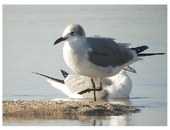
Laughing Gull in Basic plumage