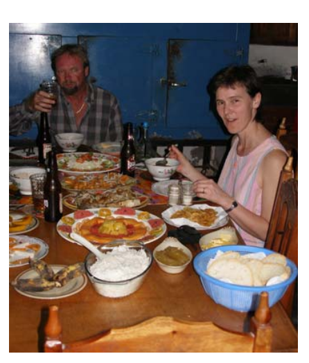
Happy birders after a nice clean-up Birding Trip

167. Chestnut Munia Lonchura atricapilla 10 Zapata 10/1, 6 Cayo Coco.