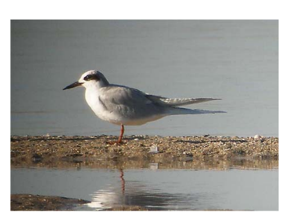
Forsters Tern 2nd Year bird