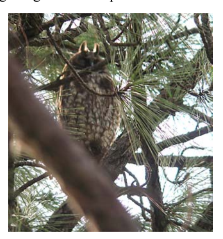
The Stygian Owl \bigcirc

19/1. Playa Larga Up 06,30 Birding La Turba forest with lots of birds and terrific views. Tennesse warbler and Summer Tanager among others. Lunch at the Crocodile farm/tourist enter and buying some souvenirs before going fishing and bathing at the coral reef at Punta Perdiz. Birding two different lagoons and a severe hurricanedamaged forest in the afternoon. Well-cooked fish at our CP.