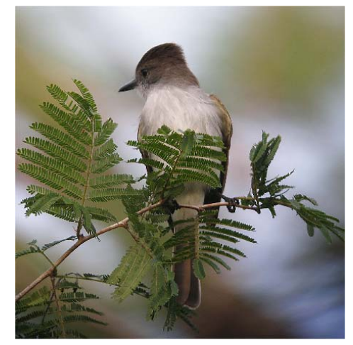
La Sagras Flycatcher

This and (maybe) Cuban Kite are our only misses of the whole trip. Birds anyway along the road in the marsh, the habitat looks very promising, until 11,30. Leaves the Autopista before Guines