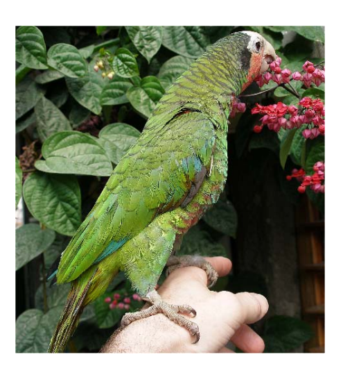
An obvious tame Cuban Parrot