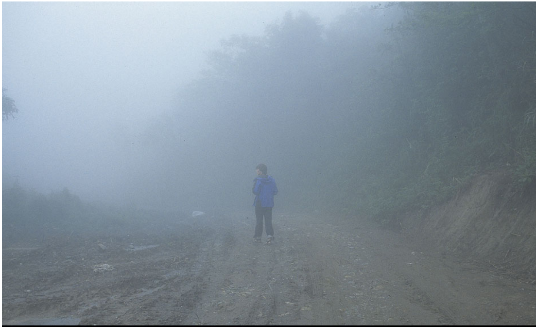
The infamous fog of Sapa...

Others have seen: Greater Rufous-headed Parrotbill, Streak-breasted Scimitar-Babbler, Coral-billed Scimitar-Babbler, Blue-naped Pitta, Purple Cochoa, White-bellied Redstart, Streaked Wren-babbler, Wood Snipe, Slaty-legged Crake, Dark-sided Thrush, White-hooded Babbler, White-gorgeted Flycatcher, Tristrams Bunting, Snowy-browed Flycatcher, Dusky Thrush,