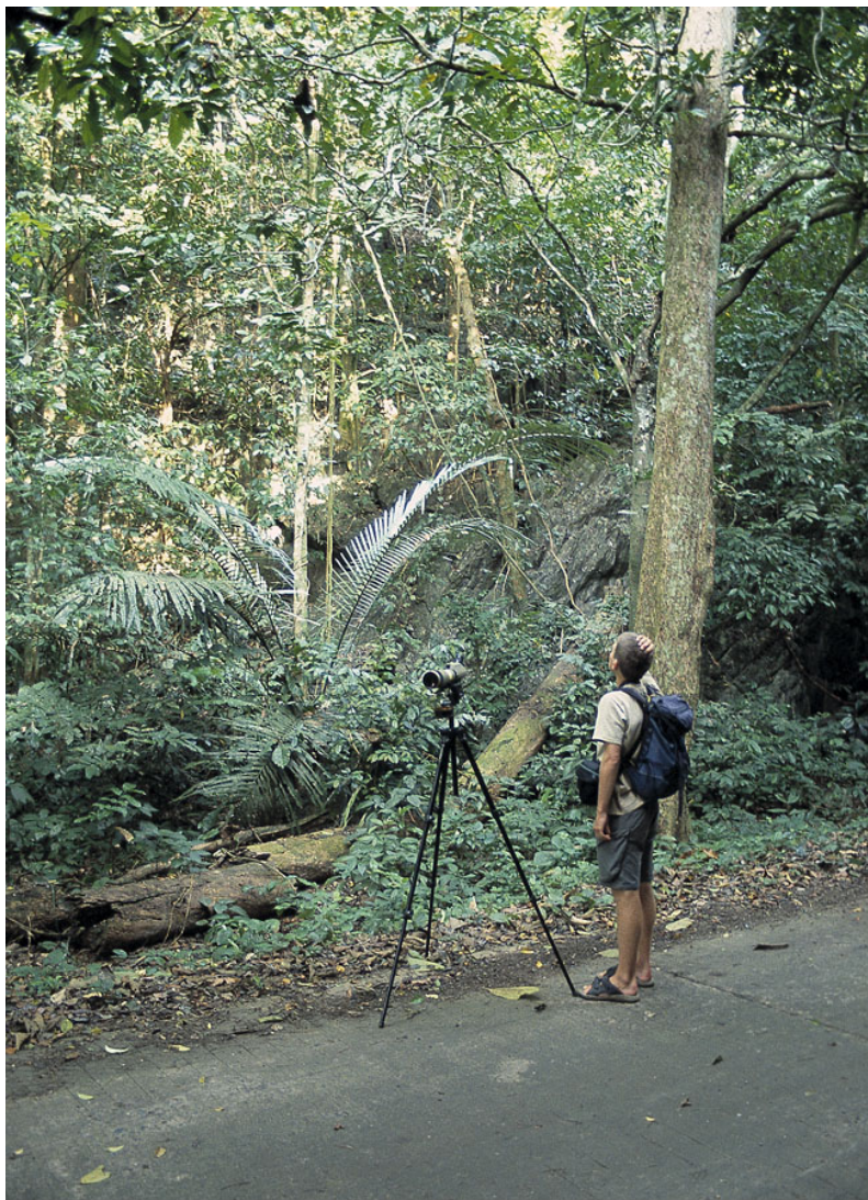
Cuc Phoung N.P.