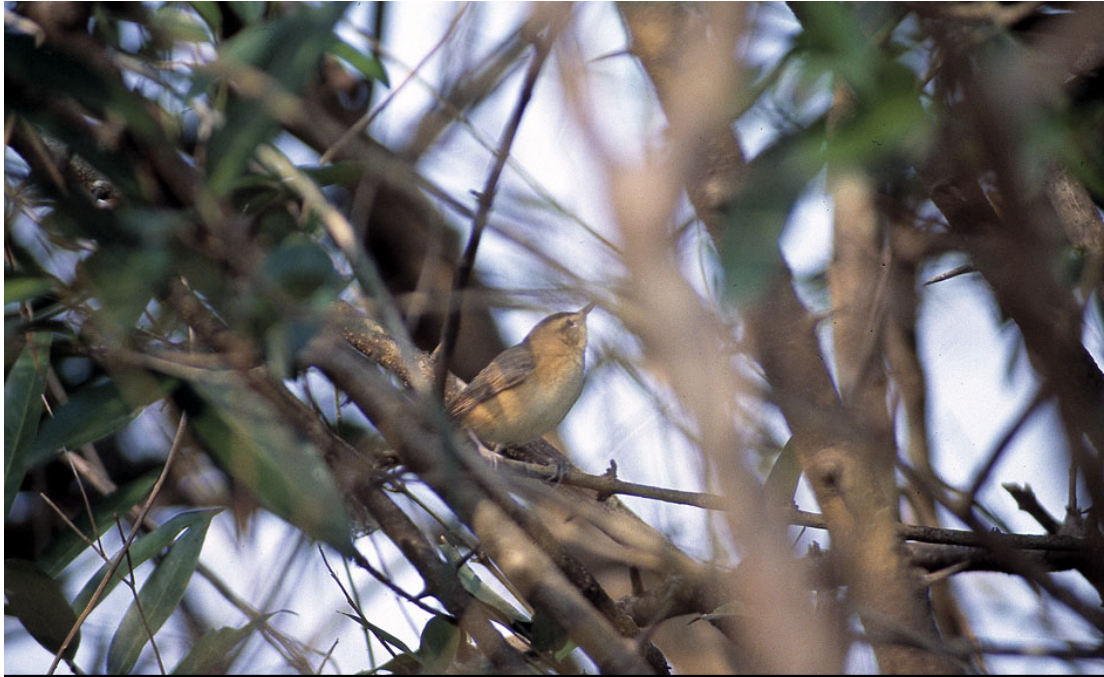
Black-browed Reed Warbler, Crocodile Lake, Cat Tien N.P.