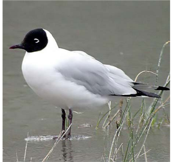
The smart-looking Andean Gull