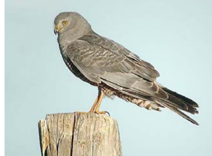
Cinereous Harrier ♂