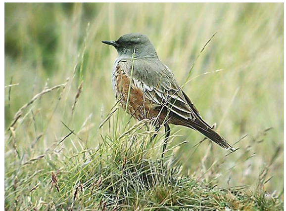
The very handsome Chocolate-vented Tyrant