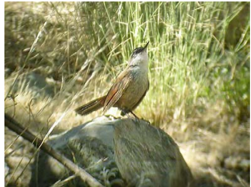
The normally skulking Crag Chilia