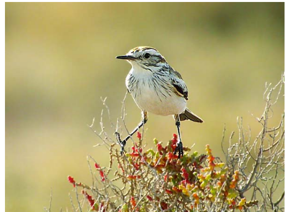
Salinas Monjita, a rare and specialized but still striking bird