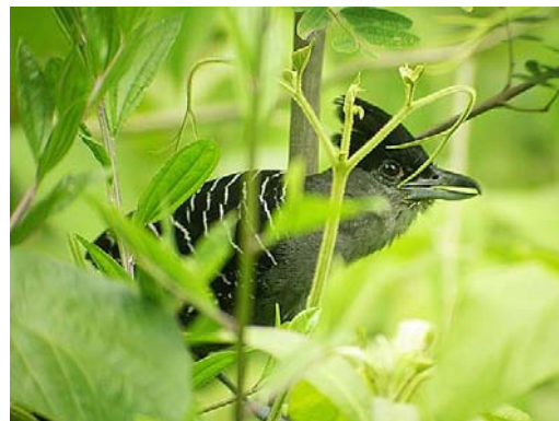
Giant Antshrike, a hard skulker not at all related to thrushes.