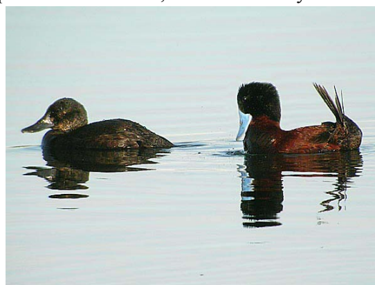
Displaying Lake Ducks

27/12. In the morning of to Gualicho with our prearranged taxis. This was a good way of travelling and birding in this area, cost was roughly 30 ps/h/car. The first 1,5 hours was very cold and nonbirdy but at 8 O'clock Anna finds three Patagonian Tinamous and eventually everyone is able to see them really close. We travel on towards Lago Argentino and take our morning coffee at and nice and cosy Indian café at the lakeside. It has been cold and windy so the indoor heat was most welcome. Along the shores, we had Dark-faced Ground-Tyrant, Cinnamonbellied GT and Darkbellied Cinclodes. Lunch in town and up at the Camino de Arribba where Chocolate-vented Tyrant was main target and we did succeed with much hassle. Dinner at the nice