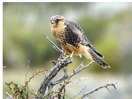
Juv Aplomado Falcon