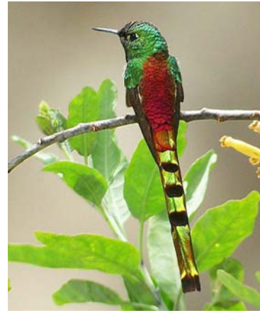
Male Red-tailed Comet