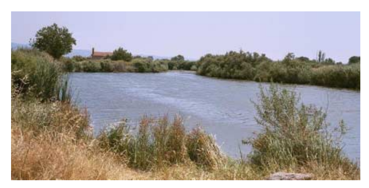
Kalloni Inland Lake on 27th June 2002.

headed Gull totalled today with 54 at the salt pans, the highest count I had during two weeks. This morning I could also summarize impressive 15 Black Storks.