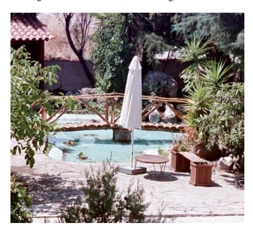
The "pond" at Malemi Hotel, which hosted a Little Grebe! 24th June 2002.