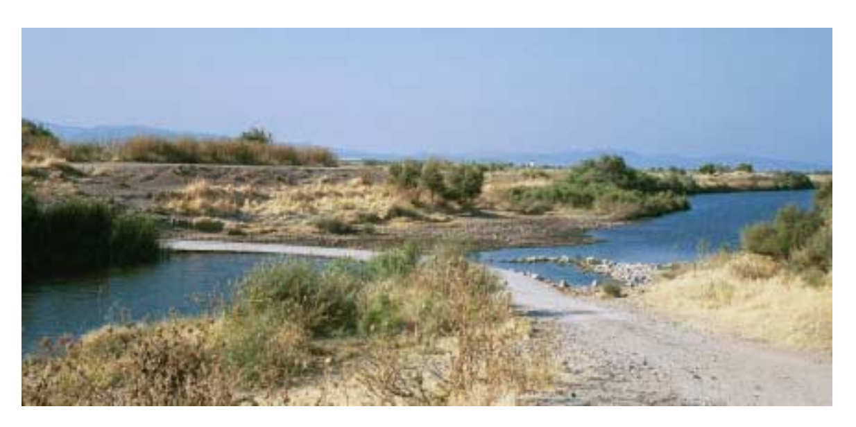
The lower ford at Tsiknias (="East") River on 28th June 2002.