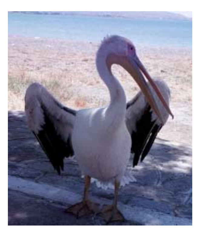
The pelican of Skala Polihnitou on 24<sup>th</sup> June 2002.

25<sup>th</sup> June (Tuesday). An early morning trip on my own to the Potamia River Valley, of course searching for Olive-tree Warbler. Negative. Noteworthy birds were three singing Turtle Doves, a Bee-eater, a Crag Martin near a possible breeding site and a singing Short-toed Treecreeper in an olive grove. At Kalloni Inland Lake I saw three Night-herons (1 ad. + 2 imm.), four Black Storks and I also heard a singing Reed Warbler. I also met two English birders, who gave me useful information on where to find Barn Owl and Scops Owl. I tried the Scops Owl tip already later this day, but I dipped. There should be a roost in a Eucalyptus tree just north of Kalloni on the Petra road. Barn Owl was said to breed behind the school in Skala Kallonis, so of course I lingered around there for a while after dusk, but without positive result.