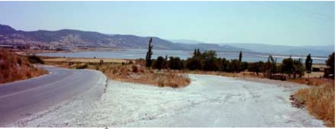
Kalloni Salt Pans from west on 24th June 2002.