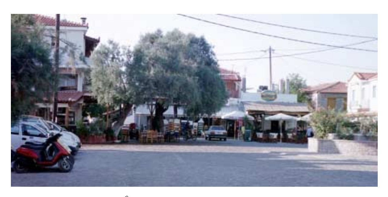
The square of Skala Kallonis on 25<sup>th</sup> June 2002. The tavern Omimis is in the centre of the picture, with its tables under the big deciduous tree. They have internet facilities in one of the cafés to the right of the parked car.