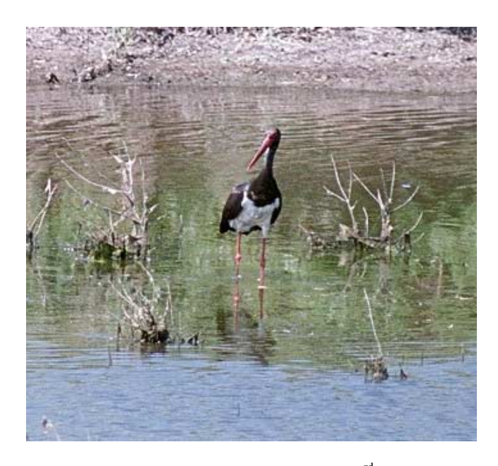
An adult Black Stork at Potamia River on 23<sup>rd</sup> June 2002.

Black Stork / Svart stork / Ciconia nigra (LINNAEUS 1758). Seen almost daily in the vicinity of Skala Kallonis. The most remote sighting was at Mikri Limni. Most of the birds seen were apparently adults, but a few were obviously younger than the rest, because their plumage was more brownish black than glossy black, and the legs and bill wasn't as bright red as the others. High count was 11 at "Derbyshire" 28/6 and altogether 15 individuals seen that day. Sightings: 1 soaring above Malemi Hotel 15/6; 1 ad. at Tsiknias River 16/6; 2 at Kalloni salt pans 16/6; 2 ad. at "Derbyshire" 16/6; 1 ad. at "Derbyshire" 17/6; 2 ad. at Mikri Limni 17/6; 1 at "Kalloni Inland Lake" 17/6; 1 (2<sup>nd</sup> year?) at Potamia River 22/6; 1 at Kalloni salt pans 22/6; 1 ad. at Potamia River 23/6; 4 at "Kalloni Inland Lake" 25/6; 2 at Kalloni salt pans 27/6; 7 at "Derbyshire" River 27/6; 2 at "Kalloni Inland Lake" 28/6; 11 at "Derbyshire" 28/6; 2 at Kalloni salt pans 28/6.