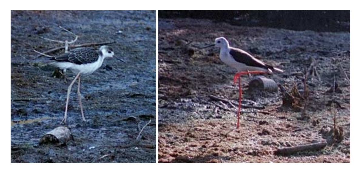
Black-winged Stilts (juvenile to the left, adult to the right, probably a female) at Kalloni Inland Lake on 25<sup>th</sup> June 2002.

Also 1 ad. at "West River" 16/6 and 1 ad. playing injured at Skala Polihnitou salt pans 24/6.