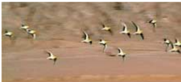
Spotted Sandgrouse Pterocles senegallus , Naama Bay sewage ponds Dec. 4 th 2000

2 at Naama Bay on 03.12.2000. At the sewage-ponds southwest of town, flying from the forest.