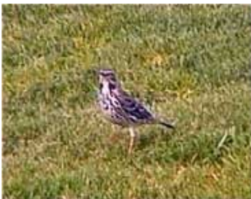
Red-throated Pipit Anthus cervinus