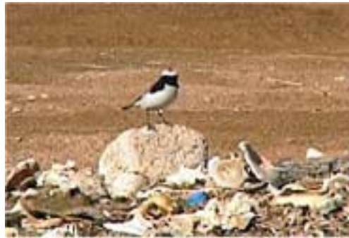
Mourning Wheatear Oenanthe lugens lugens