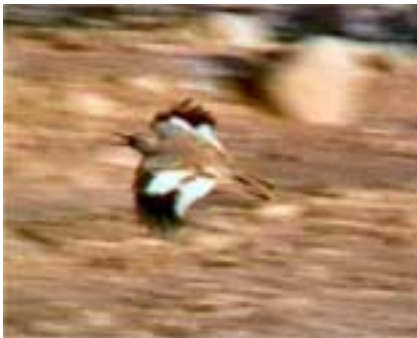
Greater Hoopoe-lark Alaemon alaudipes alaudipes

Cattle Egret ( Bubulcus ibis ibis ) At the entrance.