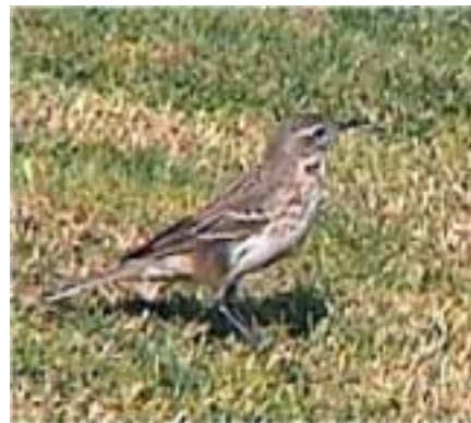
Water Pipit Anthus spinoletta coutellii

All pictures are video-grabs from Canon MV 200i Digital Video Camera