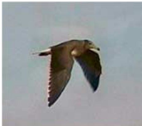
Sooty Gull Larus hemprichii , Nabq Protected Area, Dec. 3 rd 2000