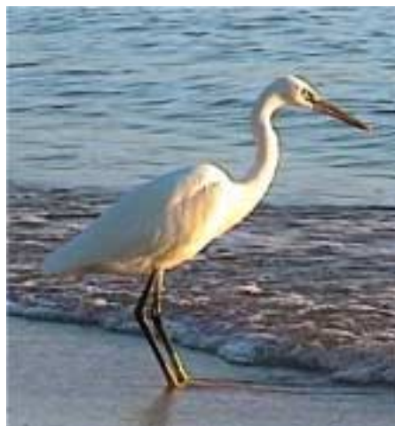
Western Reef-heron Egretta gularis schistacea , Naama Bay beach - daily

We tried St. Katherine Monastery for the Sinai Rosefinch, but among the plentiful tourists we found none. Apparently they are here at daybreak according to a local youth (?). December might be wrong as well. If you drive the whole loop and pass by El Tur on the western coast, you might want to try the sewage-ponds east of town. Again, only seen while overflying the area going home, but it looked promising.